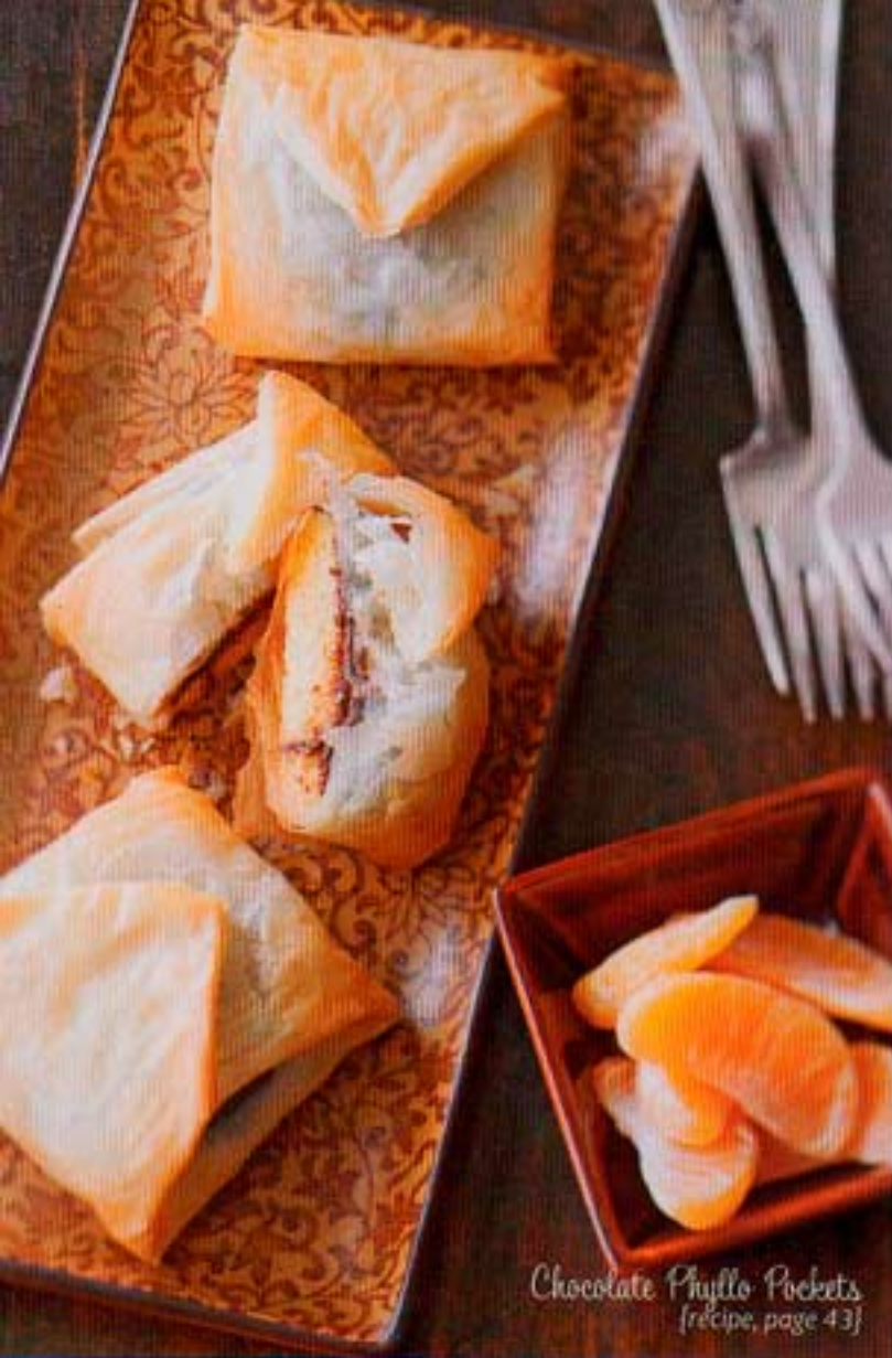
Chocolate Phyllo Pockets (recipe, page 43)