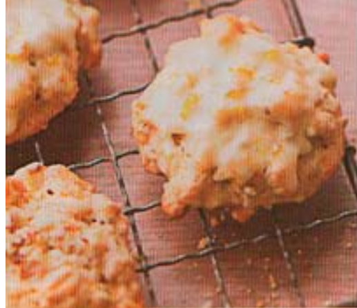
• Orange-Iced Oatmeal Cookies •